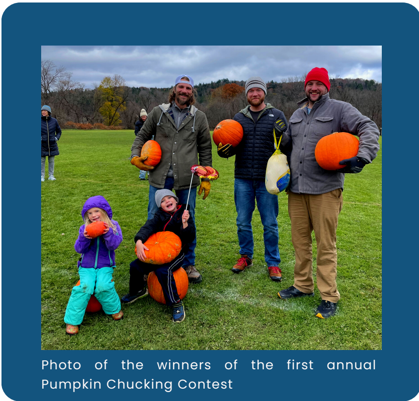
Photo of the winners of the first annual Pumpkin Chucking Contest